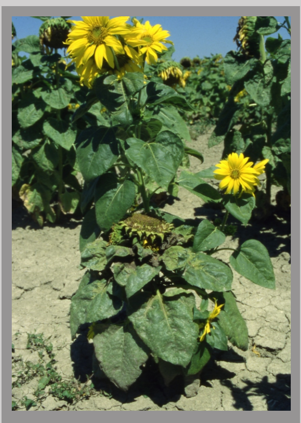
Fig.1 - Size reduction of the plant is due to an early primary infection of downy mildew

Causal agent: Plasmopara halstedii (Farl.) Berl. et de Toni (sin. Plasmopara helianthi Novot.)