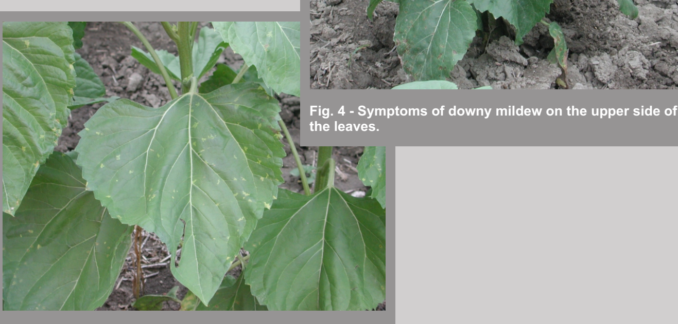
Fig. 5 - Symptoms of secondary infections affecting adult plants.