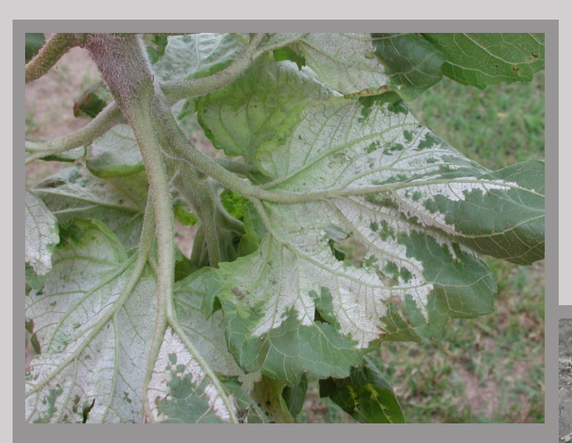
Fig. 3 - With high relative humidity, a typical whitish mycilium appears on the lower side of the leaves.

Infections begin from oospores in the soil, on crop residues and infected seeds. From dormient oospores, a macrosporangium germinates and develops, releasing several zoospores, that in turn, when close to the host plant, germinate and penetrate the vegetal tissues producing intercellular mycelia systemically invading the whole plant. Sporangia forming on the leaves are dispersed by the wind or rain splash, produce secondary infections and spread the disease to healthy plants. Infected seeds are the main source of inoculum for long distance infections and permanent contamination of disease-free soils. The pathogen, once established in the soil, may survive up to 8-10 years on infected crop debris. The disease is strongly influenced by humid climates. Since zoospores need humidity to germinate, prolonged rainy periods and frequent irrigations, particularly during the first two three weeks after the sowing, favour the occurrence of primary infections.