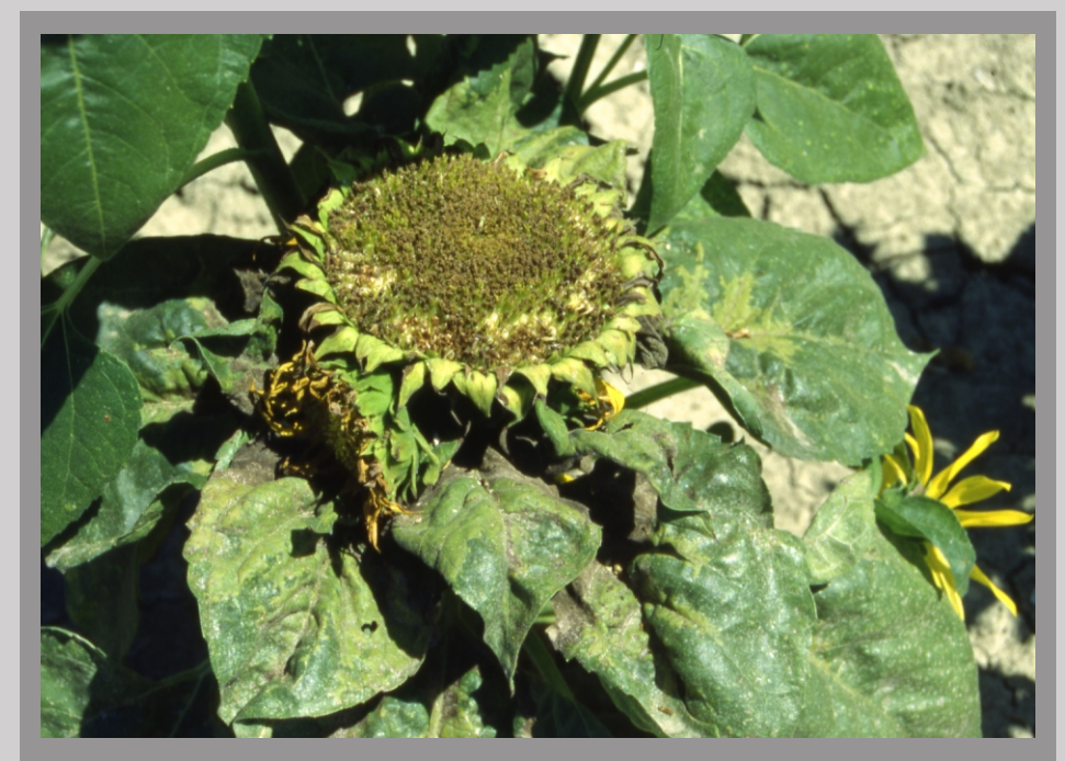
Fig. 2 - Upstanding infected sunflower calatide containing steril seeds.

Disease symptoms vary depending on the kind of infection and the crop stage of the plant. Early primary infections usually begin with a growth halt and sudden death of the young plant. Late infections appear as stunted plants compared with healthy ones, with shorter internodes and erected calatids. On leaves, pale green or chlorotic areas develop localized on the main veins. In humid conditions, a whitish mycelium bearing hyaline sporangia appears on the bottom side of the leaves. Calatids are generally sterile or producing few infected seeds because the fungus mycelia are localized on achen tissue. Secondary infections affect adult plants only. On the upper side of the infected leaves, typical white fructifications may form. Secondary infections cause no damage to the plant, which apparently grows normally. However, they are important as they represent a dangerous source of inoculum. Secondary infections may also appear as latent infections, therefore not affecting the plant growth, but at the end producing infected seed.