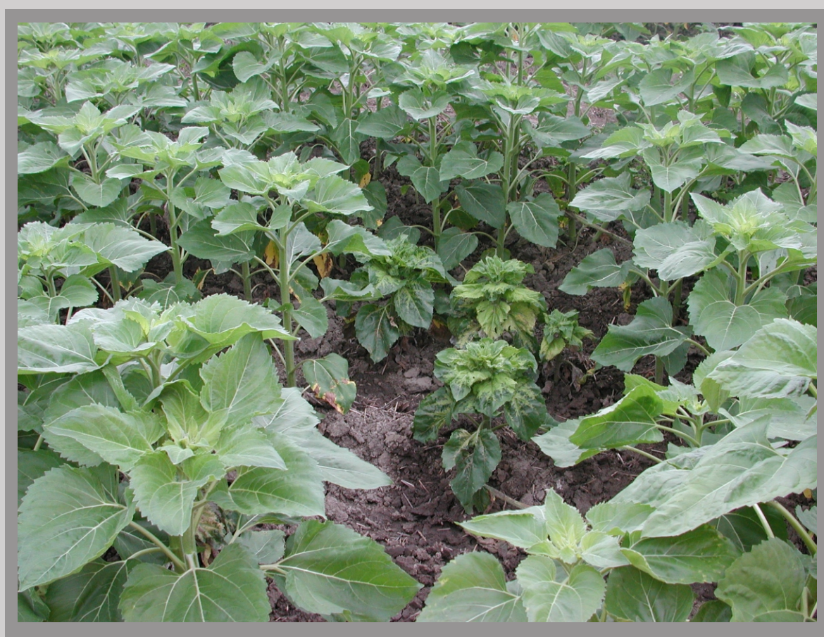
Fig. 6 - Infected plants should be promptly eliminated to avoid the spread of disease.

Since the importation of infected seeds may cause the introduction and dissemination of pathogen's new races in Italy, it is recommended to apply what specified in Legislative Decree n° 214/2005. transposing the Dir. 2000/29/EC. All the sunflower seeds coming from EU Member States must be produced in disease free areas, or adequately treated, with the exclusion of the varieties resistant to all the P. halstedii 's races currently present in the production areas. The same requirements are compulsory for sunflower seeds coming from Third Countries.